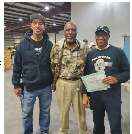
OCBC Thursday Crew

Some of the original OCBC Thursday Crew have not been able to return due to health concerns. We want you all to know you all are truly missed!