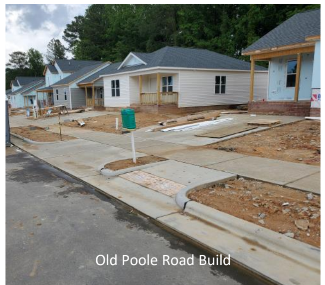
Old Poole Road Build