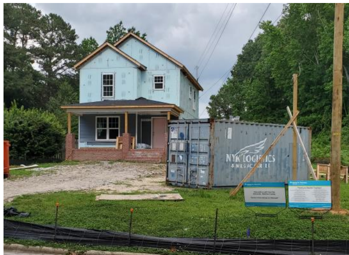
Baptist Build—Rose Lane

There have been several delays due to a rainy season, thus, there have been several days when outside work could not be completed. When work could not be done at one site because general contractors were on site, our OCBC Team was shifted to the Old Poole Road Site to help out. We were able to hook up with some of the staff and fellow volunteers which we had not seen in nearly three years. They still remember “The OCBC Thursday Crew.” Hopefully, within a month or so, the Rose Lane Build will be completed and dedicated. Then it will be off to another site.