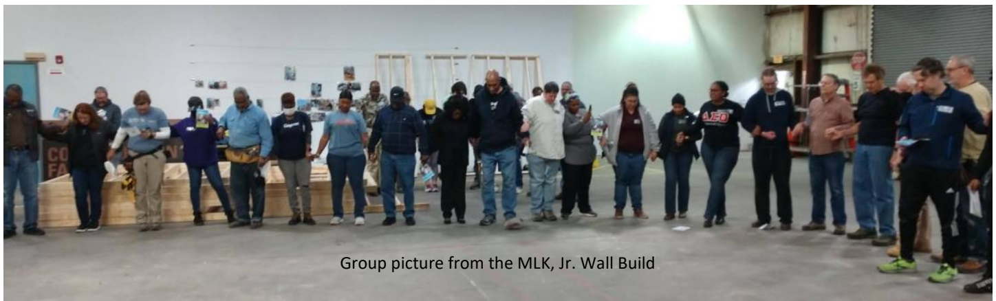
Group picture from the MLK, Jr. Wall Build

There have been several delays due to a rainy season, thus, there have been several days when outside work could not be completed. When work could not be done at one site because general contractors were on site, our OCBC Team was shifted to the Old Poole Road Site to help out. We were able to hook up with some of the staff and fellow volunteers which we had not seen in nearly three years. They still remember “The OCBC Thursday Crew.” Hopefully, within a month or so, the Rose Lane Build will be completed and dedicated. Then it will be off to another site.